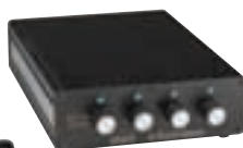
Spindle Selector Box