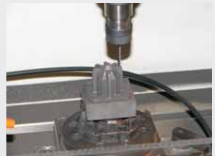
Milling graphite electrodes with HF80